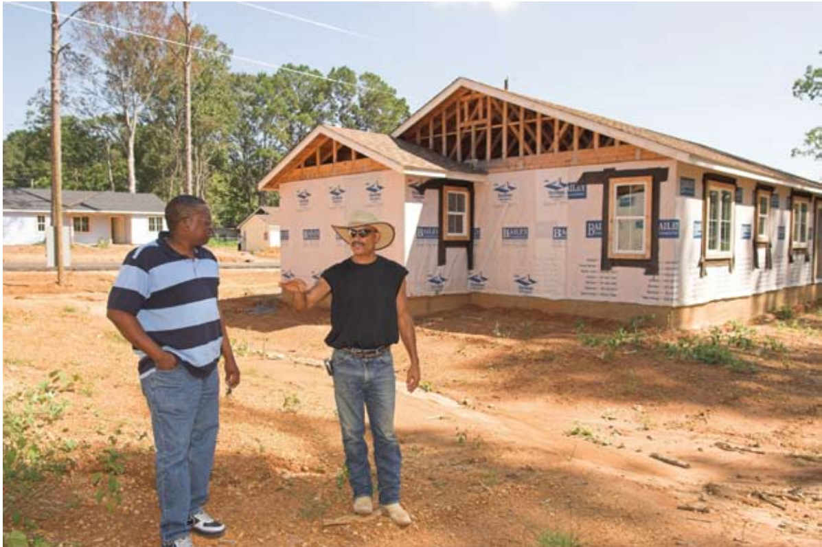
New subdivision rebuild in McComb, Mississippi through Voice of Calvary Ministries.