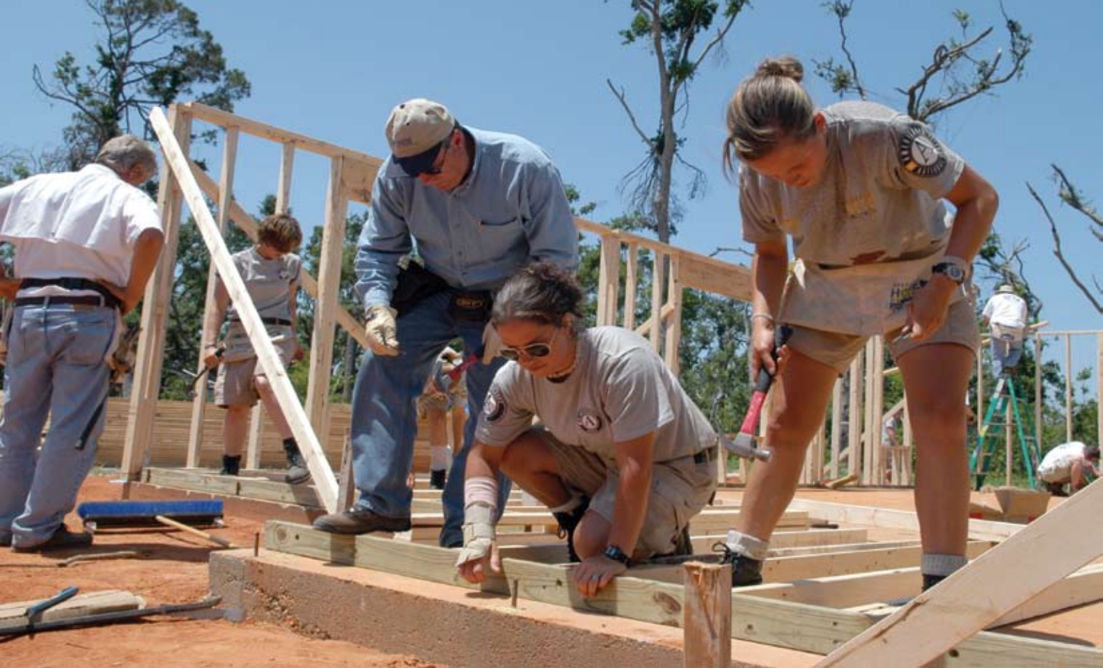
Skilled and unskilled volunteers work together in Gulf recovery efforts.